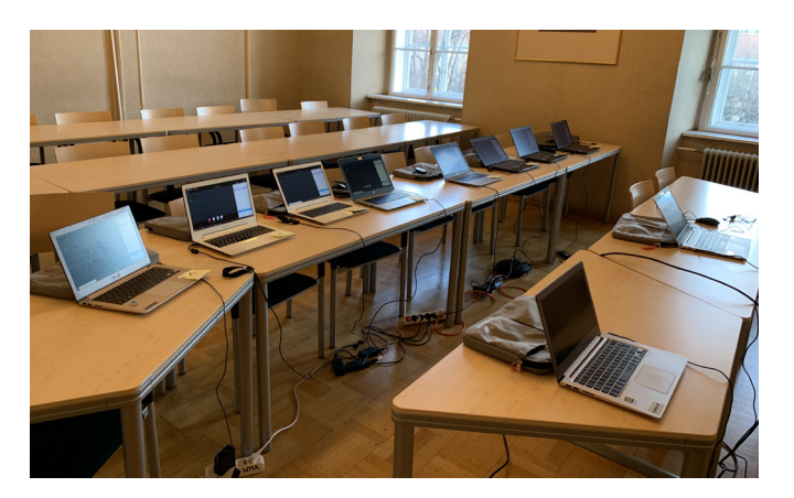
The SPC during its first virtual meeting as perceived in the Offices of the Vienna Medical Academy in March 2020.

Yes, as expected, attendees most of all missed meeting each other, using the conference to catch up with old friends and colleagues, set-up new collaborations and network. That is something that an online conference cannot and will never fully replace. But at the same time there are many reasons why online conferences are here to stay. One of the major reasons is that online conferences allow people to attend